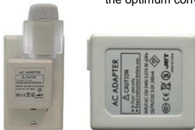
NIMBUS AC to USB Adaptor (9009) Our Price: $14.95

This Q-Link Nimbus Adapter allows you to use your Q-Link Nimbus anywhere there is an AC Wall Outlet, Providing you with the optimum convertible EMF protection.