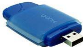
NIMBUS WITH SRT-3 USB POWERED (BLUE)

Optional AC to USB wall and Car adapter allows for discreet use anywhere beyond direct computer plug-in and more centralized placement for targeted coverage. Adapters sold separately.