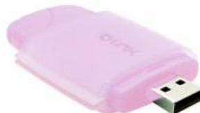
NIMBUS WITH SRT-3 USB POWERED (PINK)