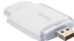
NIMBUS WITH SRT-3 USB POWERED (WHITE - NEW!)